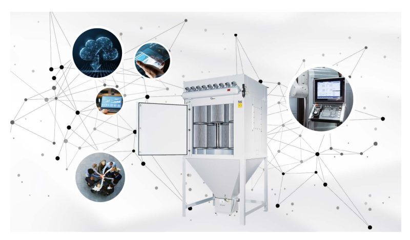
All operating data available - anywhere, anytime with FG SmartRun 4.0

The SmartRun 4.0 is an upgrade for existing or new dust collection systems. The SmartRun 4.0 system permanently records the operating parameters of your dedusting system and makes them available in real time. The measured values are continuously recorded and stored directly in a cloud using a mobile phone connection. (Alternative connection via LAN possible). The data can be accessed via a web browser via any Internet-capable PC. A mobile app for smartphones is also available. This allows easy access to all data.